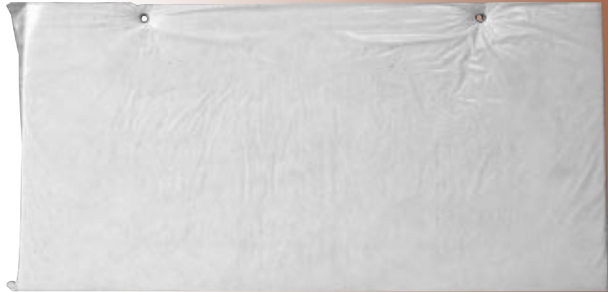
Standard 2' x 4' x 1½" thick Polywrapped Baffle with (2) grommets.

Barricade™ Polywrapped Baffles are a heat-sealed polyethylene bag encompassing a sound absorptive fiberglass fill. Standard size is 2' x 4' x 1½" thick. Grommets are installed for suspending from wire or cable ties. White or black facings are standard, additional colors are available. These efficient, economic baffles offer a high NRC rating at an extremely low cost.