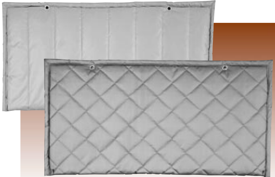
QFA Baffles 2' x 4' with (2) grommets shown in diamond and straight-stitch patterns

Barricade “QFA” Baffles are also available with either a decorative fabric facing or a nylon ripstop facing. These attractive sound absorbers offer a wide range of colorful options which can be custom tailored for any commercial or architectural application.