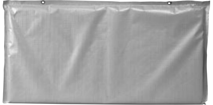
Type "A" FDA approved Sanitary Baffle, 2' x 4' x 1 1/2" thick, with (2) grommets

These Sanitary Ceilings Baffles and Wall Panels are tough enough to be washed down and maintain high NRC sound absorption values. Two baffle styles are available, Type "A" for standard duty incorporates a 1 1/2" thick 1.6 lb./cu.ft. density fiberglass core. Type "B" features additional internal reinforcement at each grommet to withstand daily high pressure, hot water wash down in addition to a higher density (3 lb./cu. ft.) 2" thick fiberglass core for improved acoustical performance.