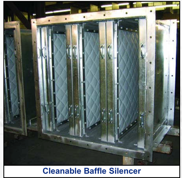
Cleanable Baffle Silencer