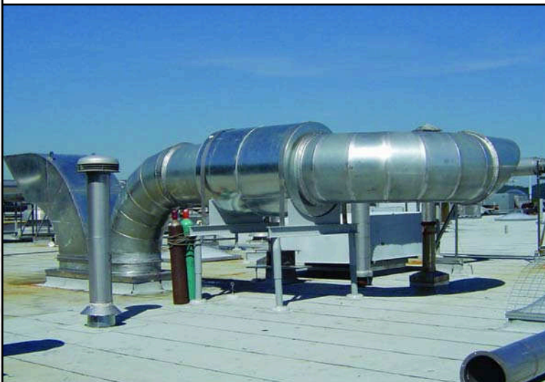
Roof Top Factory Exhaust Silencer