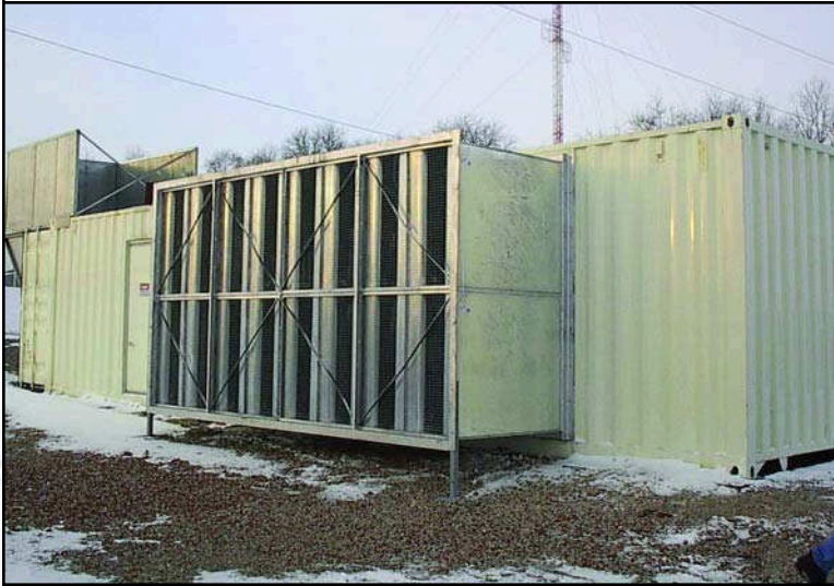
Generator Enclosure Ventilation Silencers