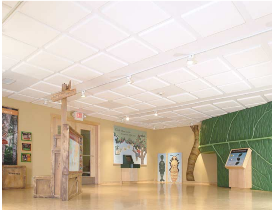
CONTOUR tiles have a light reflectancy of 86.

CONTOUR tiles add distinction, value and outstanding acoustical control to offices, call centers, lobbies, entertainment facilities, conference and board rooms, entries, retail stores, lodging and healthcare facilities, among others.