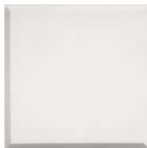
Basix 1 & 2