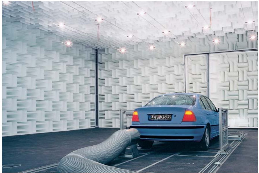
SONEX Wedges can be used to create full anechoic or hemi-anechoic chambers.