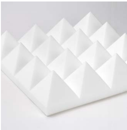
Made from pinta's willtec acoustical foam, SONEX Pyramid Panels, as the top absorber layer in a SONEX Trilayer System, provide cutoff frequencies of 63 Hz or higher.

The SONEX Trilayer System allows extraordinary space savings thanks to an innovative combination of resonator, barrier and absorptive material layering. This system effectively meets a variety of testing needs and can be easily adapted to existing rooms or areas with limited space. To meet your cutoff frequency and test method requirements, SONEX Trilayer is available in three absorption layer options, all are constructed using pinta's innovative Class 1 fire-rated willtec® foam.