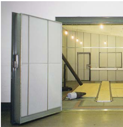
Hemi-anechoic chamber at Continental Brakes in Hannover, Germany contains the SONEX Trilayer System with SONEX Flat Panels.

pinta offers a complete solution—from facility design through final certification—with products and expertise to meet the most demanding needs. Our traditional solution, SONEX® Unilayer System and our new space-saving SONEX Trilayer System are designed to meet unique requirements for room and test specimen size, cutoff frequency and your precision test method. Our demanding test environments have exceptional performance from the desired cutoff frequency through the highest frequencies. Offering two decades of experience, pinta's full and hemi-anechoic chambers are the preferred choice for industry-leading companies worldwide.