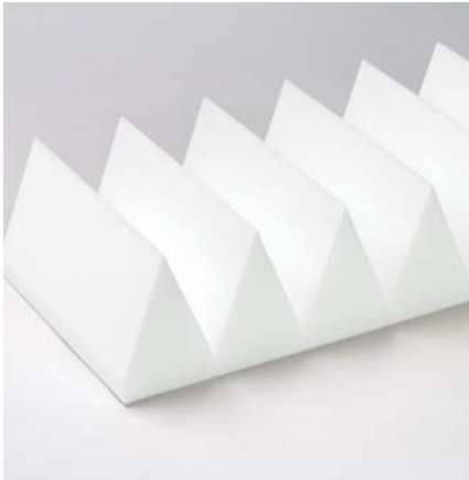
SONEX Wedges provide exceptional low- to high-frequency sound absorption.

The long-established workhorse of the acoustic test chamber, SONEX Unilayer System utilizes either SONEX Super or SONEX Max Wedges. The wedges, constructed from pinta's innovative willtec® foam, have an increased surface area for exceptional acoustical performance. They are lightweight and install seamlessly for a continuous panel look.